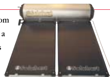
The most environmentally friendly hot water system in the world

As hot water is drawn from a Solahart system, cold water is prevented from mixing with hot water. The incoming cold water enters the tank through a laminar "soft flow" cone shaped stratifier, which diminishes the diluting effect of the cold water and helps keep the hot water hot. Another Solahart design feature - a special outlet scoop located at the very top of the tank - ensures that the outflow water is taken from the hottest point.