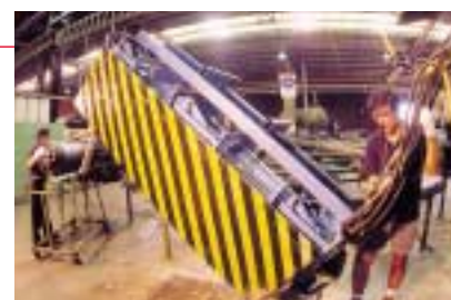
Solahart uses CFC free insulation

Solahart use two methods of generating hot water during times of low solar radiation or darkness, or when heavy demand has depleted the storage tank.